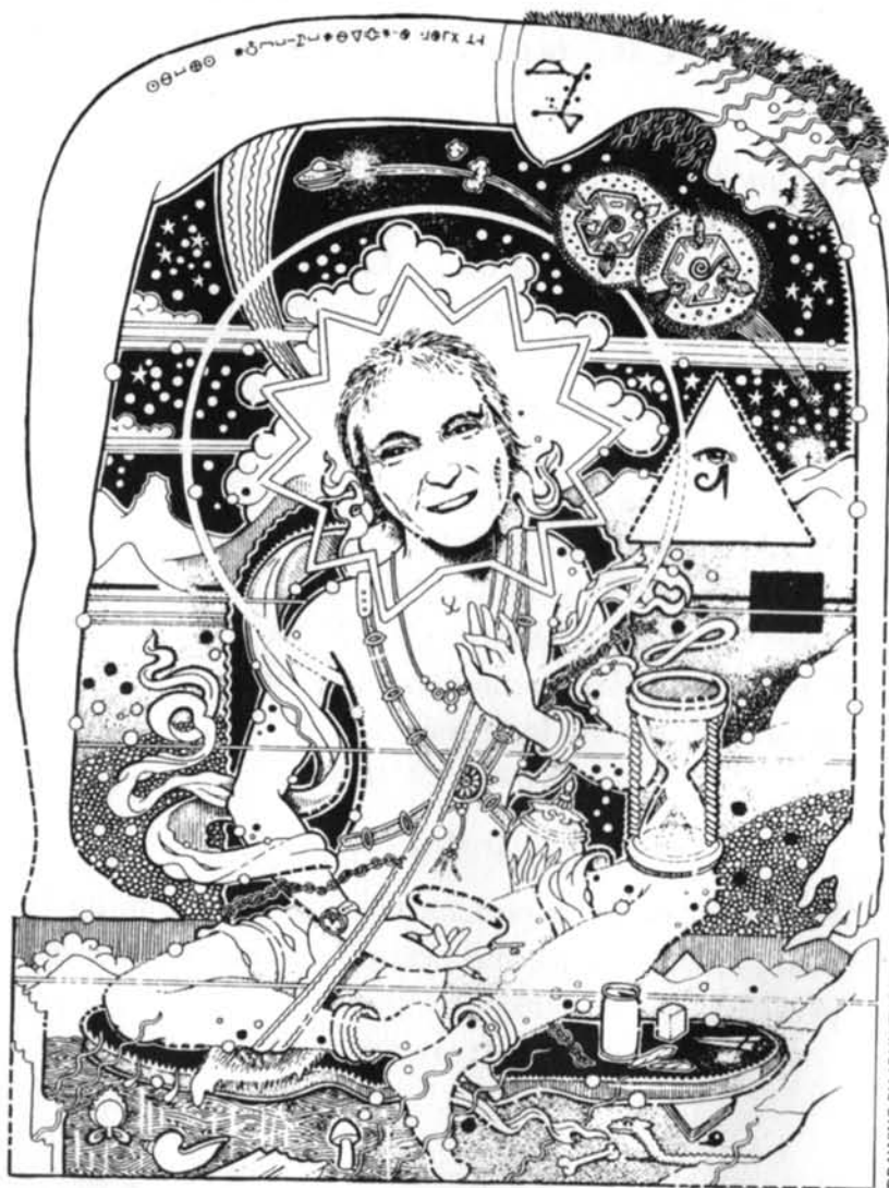
(FROM COSMIC TRIGGER BY ROBERT ANTON WILSON)